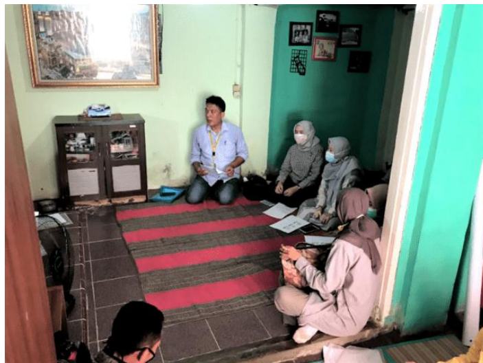
Figure 3 Delivery of Material

This training activity can run smoothly. This is due to the factors that support running the service activities. Things that support the running of this service activity, namely the full support of the community in Kerinjing Village by providing training facilities and welcoming this training and hope that in the future this training activity can continue in the future. Another supporting factor is the enthusiasm of the participants to take part in this training to understand the importance of Article 23 Income Tax.