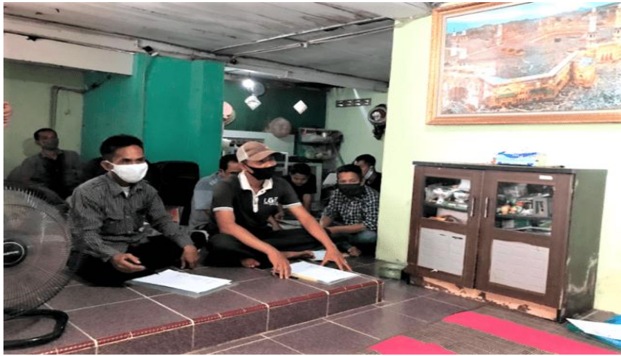
Figure 4 Participants Listen to the Content

During the session we presented a material presentation regarding the calculation and reporting of Income Tax Article 23 to village government officials in Kerinjing Village. The presentation was facilitated by in-focus and print out power points which were distributed to the participants in order to understand the material completely. The presentation provides basic material, which are Definition of Tax, Tax Function, Distribution of Tax Law, Distribution of Tax Types, Tax Imposition Rates and Tax-related regulations.