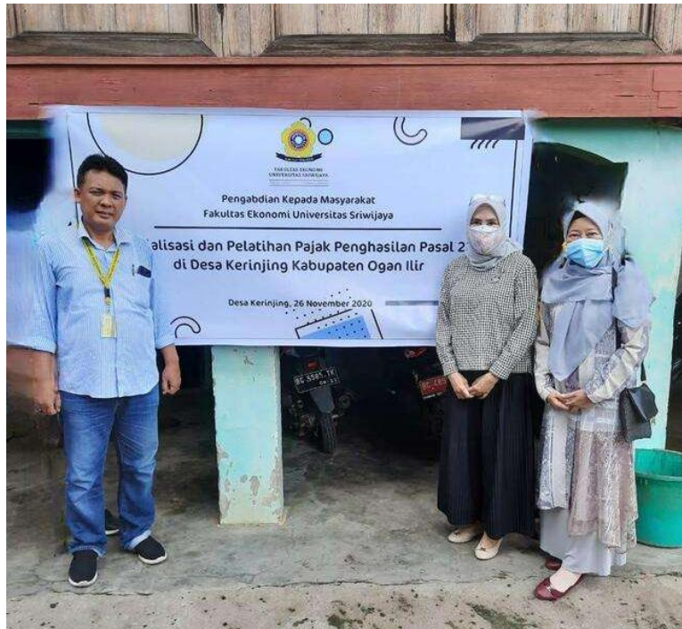
Figure 2. Service Implementation Activity Process

This training activity can run smoothly. This is due to the factors that support running the service activities. Things that support the running of this service activity, namely the full support of the community in Kerinjing Village by providing training facilities and welcoming this training and hope that in the future this training activity can continue in the future. Another supporting factor is the enthusiasm of the participants to take part in this training to understand the importance of Article 23 Income Tax.