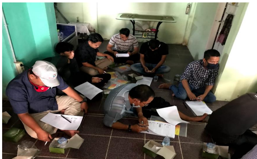
Figure 4. Participants Listen to the Content

At the time of the session we presented material explanations regarding the calculation and reporting of PPN to the village government officials in Kerinjing Village. The presentation was facilitated by in-focus and print out power points which were distributed to the participants in order to understand the material completely. The presentation provides basic material, likely Definition of Tax, tax Function, Distribution of Tax Law, Distribution of Tax Types, Tax Imposition Rates, Tax-related regulations. After that, special material regarding PPN is presented the Definition of PPN, PPN Imposition Rates, Basis for Imposing PPN PPN collection and PPN related regulations.