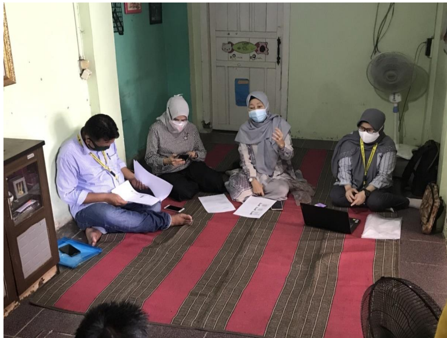
Figure 3. Delivering the Materials

At the time of the session we presented material explanations regarding the calculation and reporting of PPN to the village government officials in Kerinjing Village. The presentation was facilitated by in-focus and print out power points which were distributed to the participants in order to understand the material completely. The presentation provides basic material, likely Definition of Tax, tax Function, Distribution of Tax Law, Distribution of Tax Types, Tax Imposition Rates, Tax-related regulations. After that, special material regarding PPN is presented the Definition of PPN, PPN Imposition Rates, Basis for Imposing PPN PPN collection and PPN related regulations.