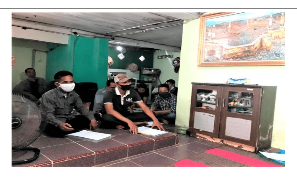
Figure 4 Participants Listen to the Content

During the session we presented a material presentation regarding the calculation and reporting of Income Tax Article 23 to village government officials in Kerinjing Village. The presentation was facilitated by in-focus and print out power points which were distributed to the participants in order to understand the material completely. The presentation provides basic material, which are Definition of Tax, Tax Function, Distribution of Tax Law, Distribution of Tax Types, Tax Imposition Rates and Tax-related regulations.