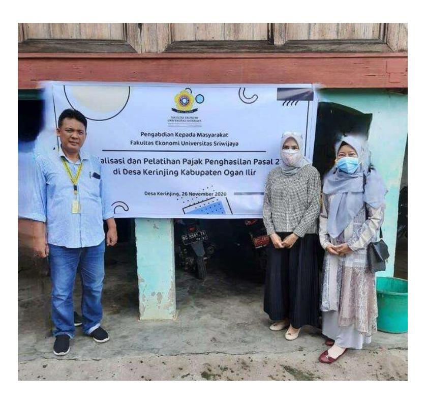
Figure 2. Service Implementation Activity Process

This training activity can run smoothly. This is due to the factors that support running the service activities. Things that support the running of this service activity, namely the full support of the community in Kerinjing Village by providing training facilities and welcoming this training and hope that in the future this training activity can continue in the future. Another supporting factor is the enthusiasm of the participants to take part in this training to understand the importance of Article 23 Income Tax.