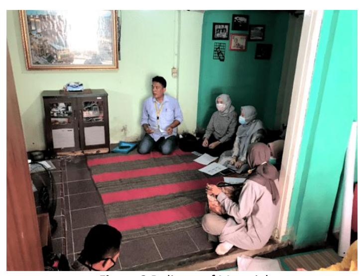
Figure 3 Delivery of Material

This training activity can run smoothly. This is due to the factors that support running the service activities. Things that support the running of this service activity, namely the full support of the community in Kerinjing Village by providing training facilities and welcoming this training and hope that in the future this training activity can continue in the future. Another supporting factor is the enthusiasm of the participants to take part in this training to understand the importance of Article 23 Income Tax.