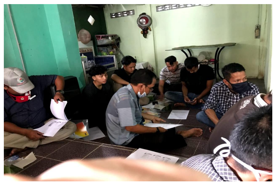
Figure 3. Photo Session with Participants

Thirty one participants consisting of small business actors in Kerinjing village participated in this assistance activity for the preparation of cash flow reports for small businesses in Kerinjing village.